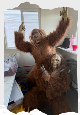
THE SQUATCH's FERN45 VIPS

& MANY MANY VOLUNTEERS WHO HELP THIS EVENT RUN SMOOTHLY